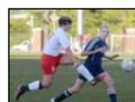
Soccer: Hendersonville vs. Richon