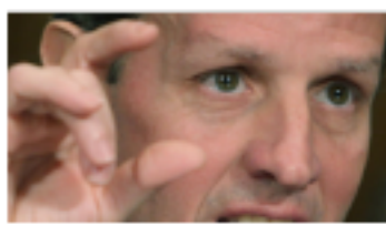
U.S. Economy Headed For Large ...