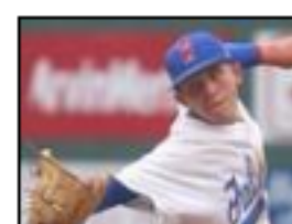
Baseball: West vs. St. Stephens