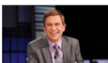
3 small businesses you won't believe ... (CNBC)