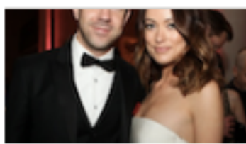
Inside the 2013 Costume Institute ... (Vogue)