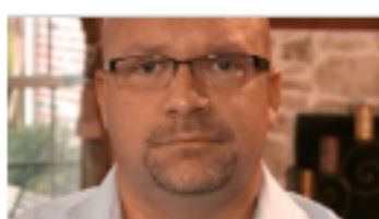
From Youth Pastor to Financial Guru:...