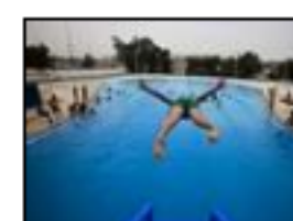
Best weekend photos, May 11-12