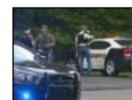
Shooting Piney Ridge Drive