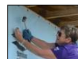
Women Work on a Habitat for Humanity