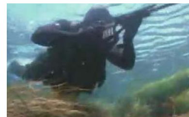
Navy SEALs Celebrate 50 Years of Service